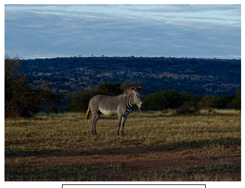
Grevy's Zebra

A pair of recent papers in Landscape Ecology (DOI: <u>https://doi.org/10.1007/s10980-021-01232-8</u>) and Biological Conservation (DOI: <u>https://doi.org/10.1016/j.biocon.2020.108436</u>) analyze data accumulated over many years at the Mpala Research Centre in Kenya using new tools and make important observations on landscape connectivity and wildlife use of it, with actionable implications for design of roads, fences, and infrastructure in central Kenya.