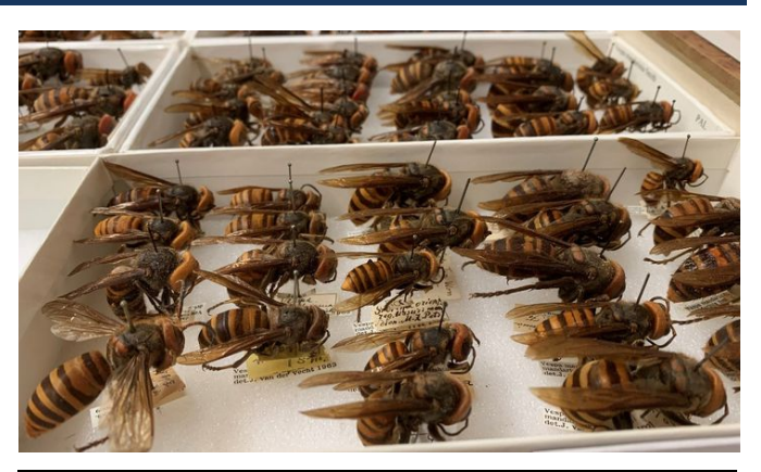
The National Museum of Natural History's entomology collection has many Asian giant hornets. Recently, the collection grew with new specimens from an eradicated nest in Washington State.

"Urgent" interceptions of insects and mites detected at U.S. ports of entry arrive daily and must be identified immediately by U.S. Department of Agriculture ("USDA") staff at NMNH. USDA staff have used the National Insect Collection as a unique spatiotemporal database to