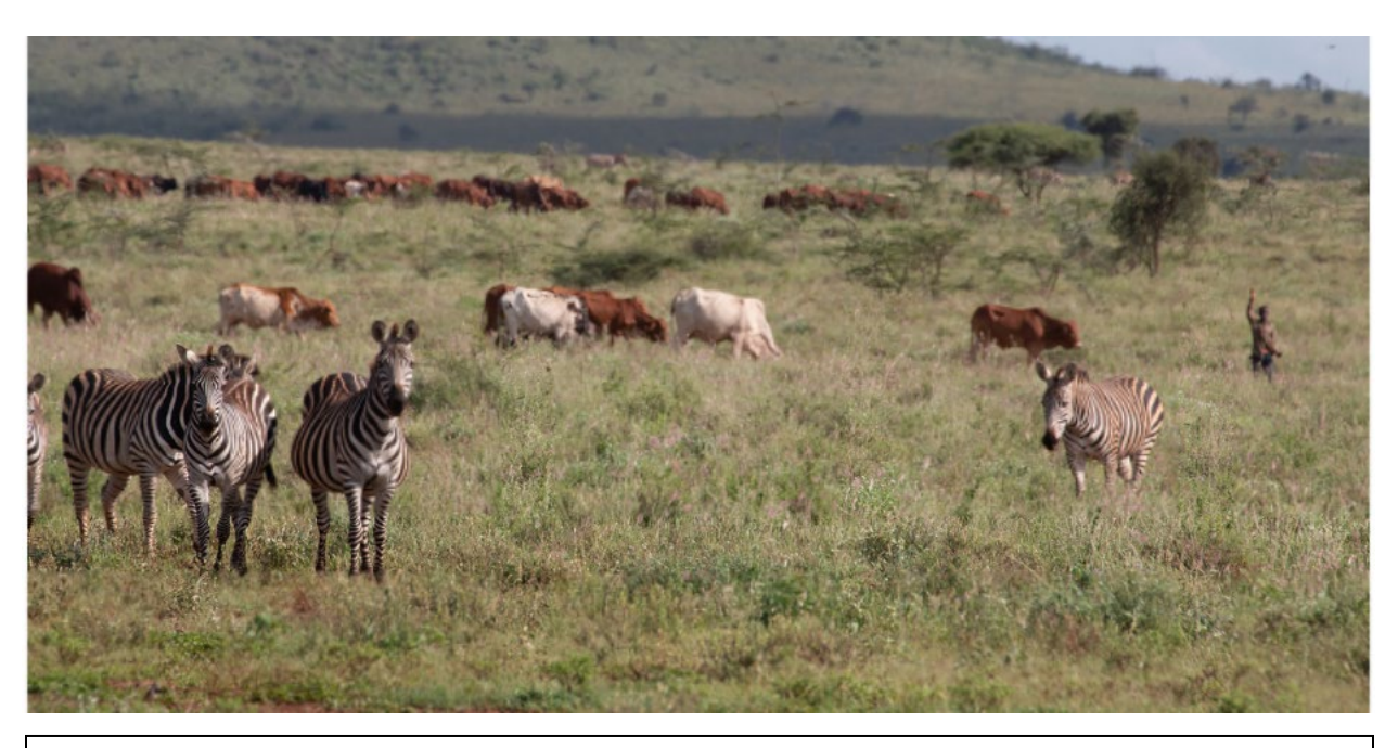
Increased human—animal interactions lead to the emergence and spread of zoonotic pathogens, which cause about 75% of infectious diseases affecting human health. In this photograph, wild zebras graze alongside a pastoralist and cows in Kenya.

NEW MODEL FOR INFECTIOUS DISEASE COULD BETTER PREDICT FUTURE PANDEMICS